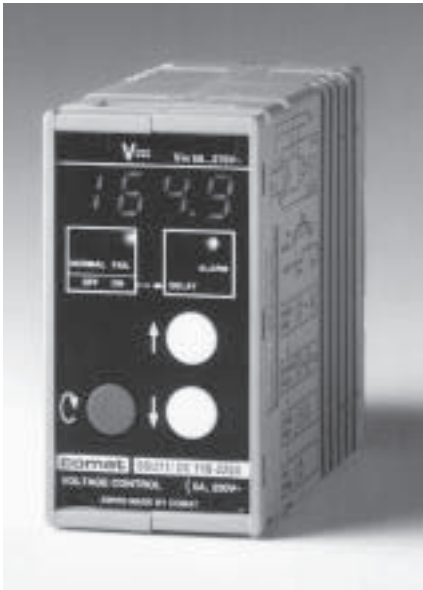
WHD: 38x72x92 mm

With these devices, Comat has set new, trendsetting standards in voltage monitoring. The high accuracy of measurement and functional reliability also permits unconventional applications and increases the operational safety of your system. Let us know your problem - we can find a solution together.